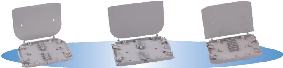
#002 160X122X10mm #011 160X122X10mm #004 180X127X14mm